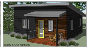
SHED ROOF OPTION