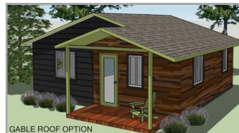
GABLE ROOF OPTION